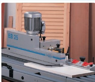
Feed unit: feeding of the work-piece to be edged.