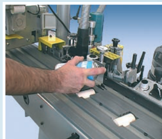
Non adherent without silicone for edgebanders.