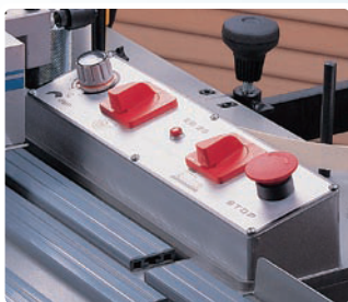
Safety control (STOP). Electronic temperature control.

► For panel edging with preglued PVC, melamine and veneer. Automatic edge feeding system. Trimming on both sides. Motorized top and bottom trimming unit. Front edge trimming, rear flush cutting of the tape. No compressed air or dust collector required. Powerful hot air system with electronic temperature control. Minimum heat up time (2 min). Belt feeder for automatic workpiece.