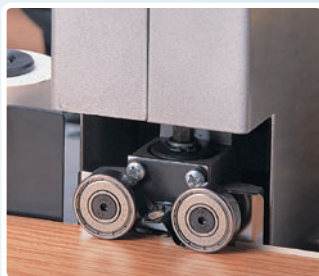
Power trimming unit: trimming both sides simultaneously.